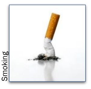
Modifiable Risk Factors for Sciatica